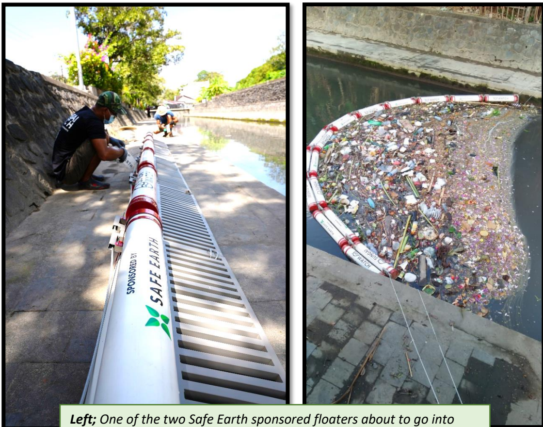
Left; One of the two Safe Earth sponsored floaters about to go into action on 13 August 2021. Right, the second “catch” 22 nd August 2021.