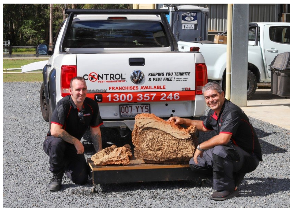
Termite Nest - Pest Control Brisbane