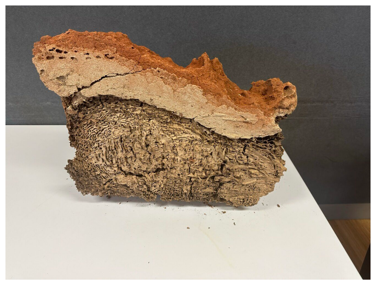
Termite Nest - Control Pest Management Brisbane

They can also provide advice on DIY termite prevention methods to complement their services. By investing in regular inspections and professional pest control services, homeowners can take proactive measures to prevent termite damage, safeguarding their property and saving on costly repairs in the long run.