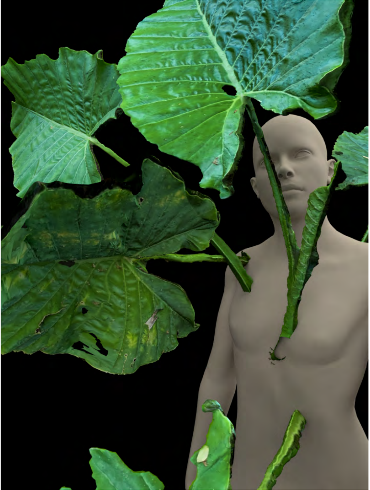
Image: Yandell Walton, MultiSpecies Convergence , 2023. Video still.