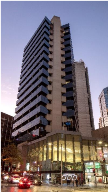
Picture from George Street