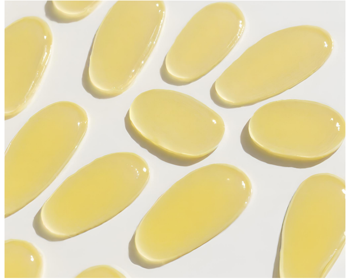
Gel like texture that doubles as a serum