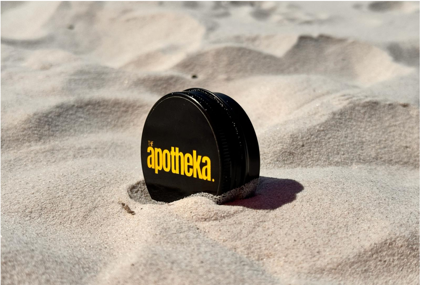
The plastic free jar of magic full of natural goodness.

"Who needs snake oil or the pressure to embody a Photoshop fantasy?" scoffs Ridhi, THEAPOTHEKA's founder and chief rebel. "Your skin is a masterpiece, not a project. BasicBatch is your weapon of choice—a straightforward, mighty ally to enrich your skin, minus the drama."