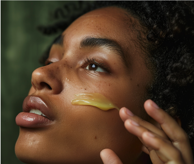
Absorbs into the skin, keeping it hydrated